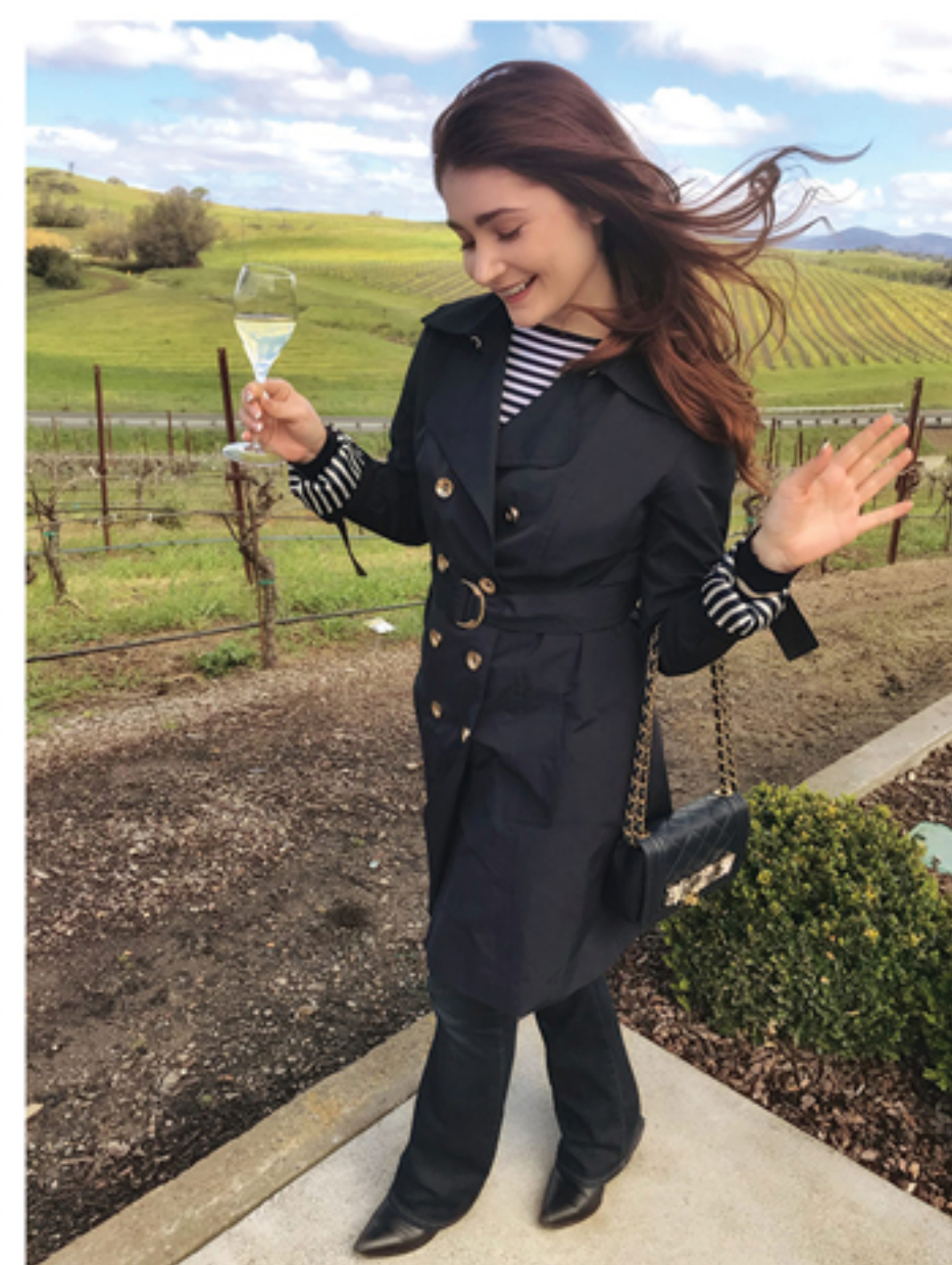
Grab a glass and take in beautiful views of the Carneros Region's lush green rolling hills.