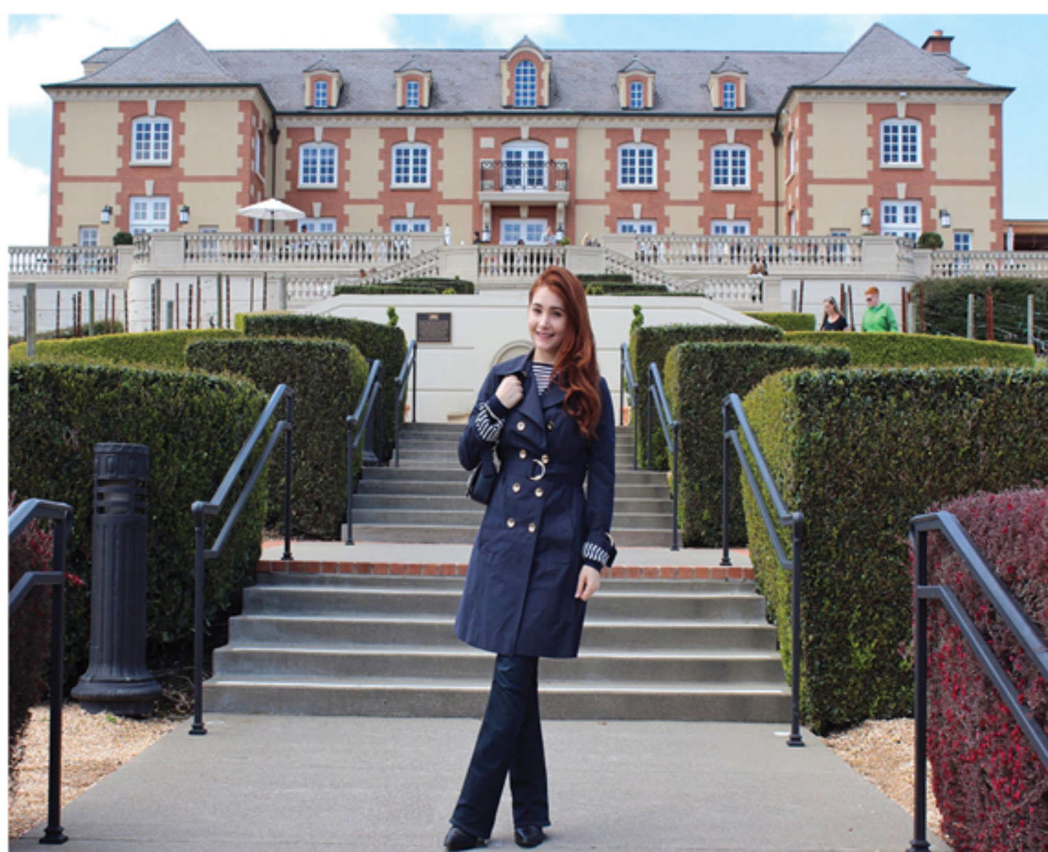
Beautiful chateau modeled after the 18th Century Château de la Marquetterie in France. Wearing Luisa Spagnoli Stanford trench coat.

POSTED APRIL 13, 2018 IN FEATURED, FOOD, NAPA, NAPA WINERIES, WINE