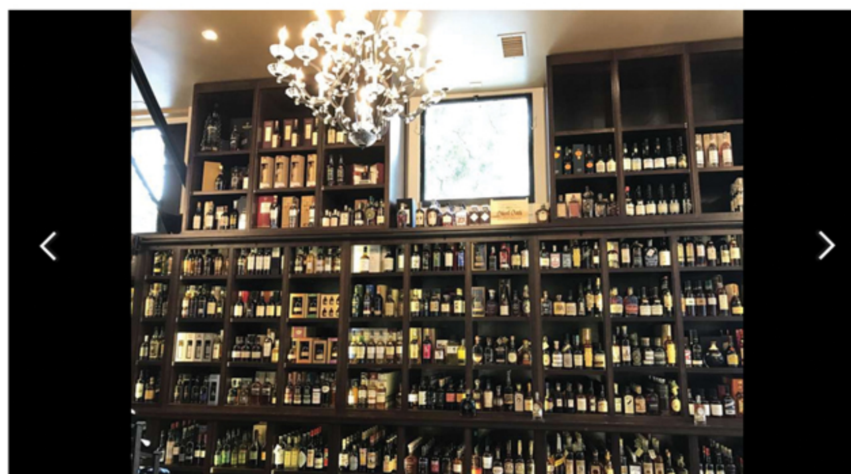
IMAGE 3 OF 3 The spirits selection at Maison Corbeaux.