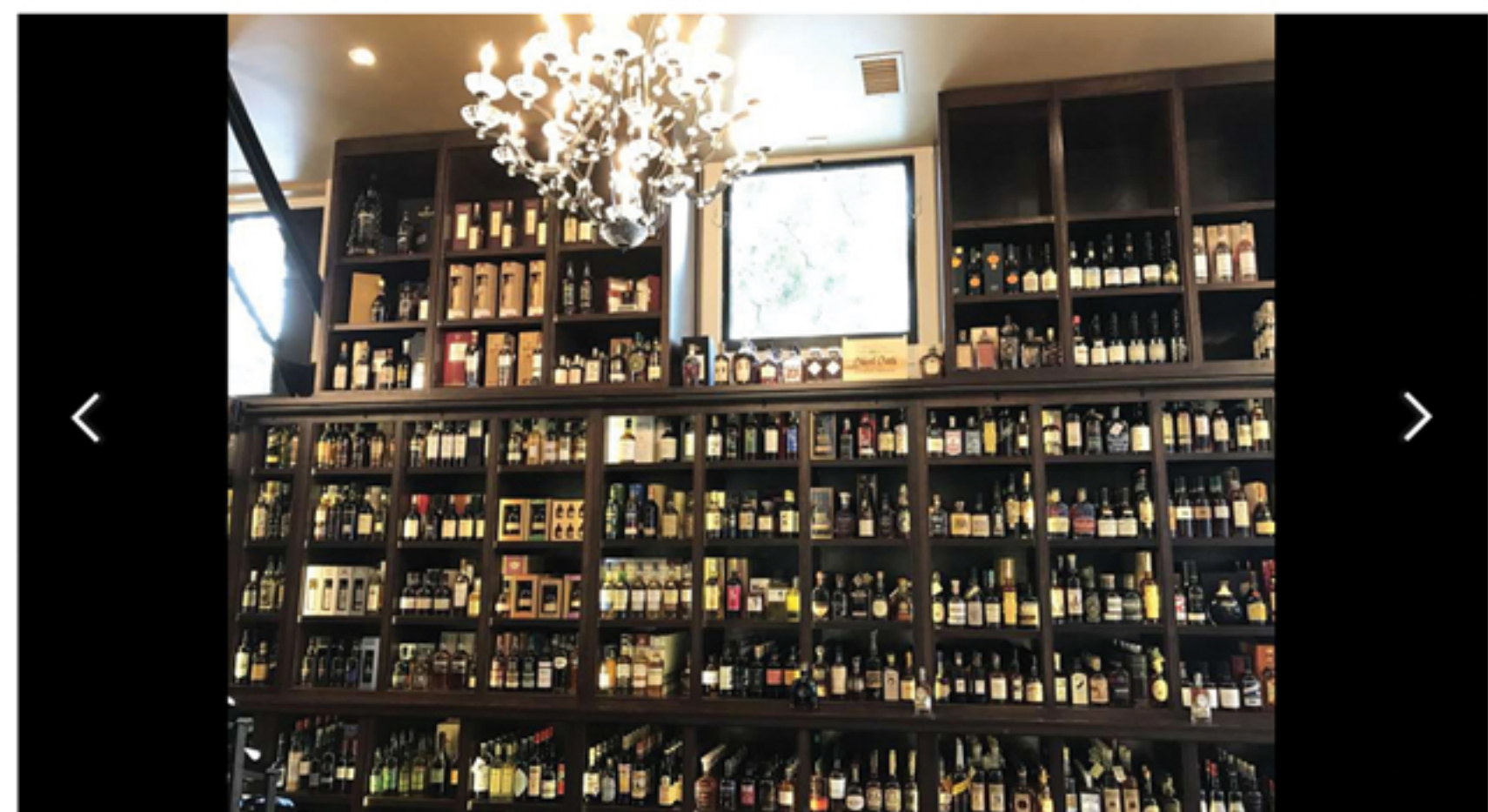
IMAGE 3 OF 3 The spirits selection at Maison Corbeaux.