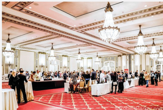
Attendees at the San Francisco Matter of Taste event in November.

Saturday, Feb. 20 2 p.m.–6 p.m. Mandarin Oriental 80 Columbus Circle a-matter-of-taste.com