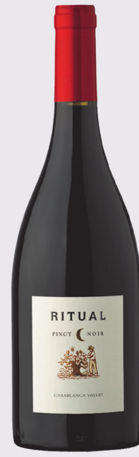
2015 Ritual Pinot Noir

The cool climate and coastal vineyards of Chile's Casablanca Valley make for vibrant pinot noirs, a grape variety not usually associated with the country. Ritual takes advantage with the aromas of cherries and raspberries and a juicy, balanced flavor. ■ Price: $19.99.