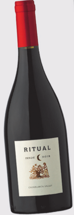
2015 Ritual Pinot Noir