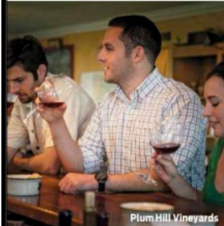
Plum Hill Vineyards

Need a break from vino? SakéOne offers free sake brewery tours daily and unique tasting flights. Call ahead before your first visit to Kookoolan Farms . It has a self-serve farm