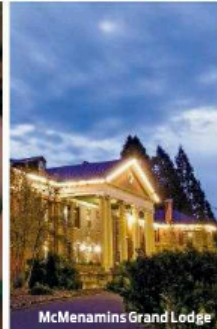
McMenamins Grand Lodge